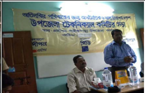
DctRj v tUKibK'vj Kigulji mfv