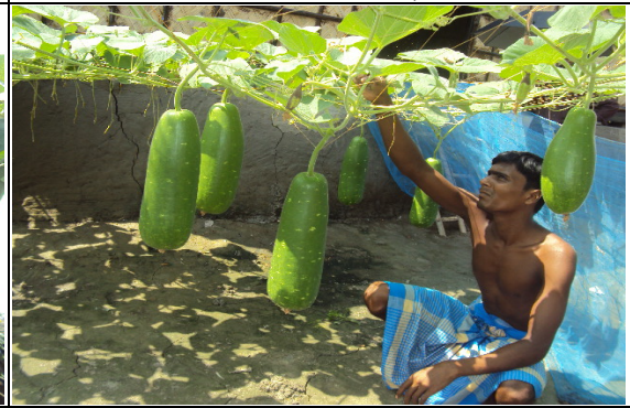
DcKri tffWmt` i eKí R̄meKiq̄b (m̄iã Pvl)