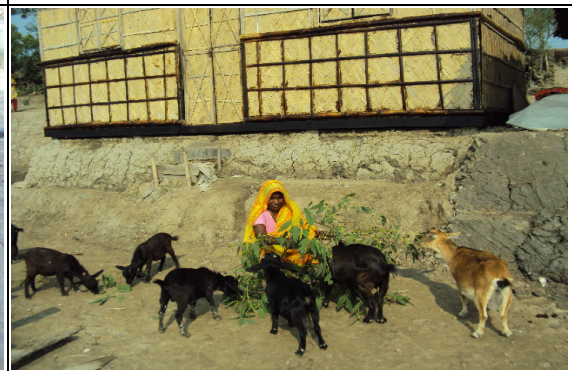
DcKri tffWmt` i eKí R̄meKiq̄b (Qm̄J cij b)