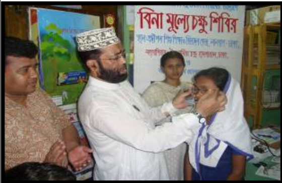
Free Eye Camp for Working Children