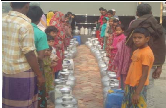
ii fim o Amigwmm c o l o l o q c o l o Z o i o e o i x L o evi c o mb mi o e o ivn