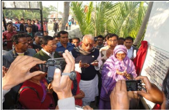
ii fim o Amigwmm tgu k tbi Di o vab