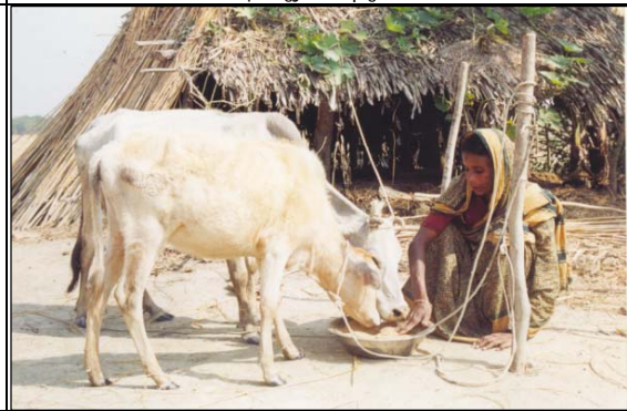
Այգ քոցյ K Kիիբց (IGA)