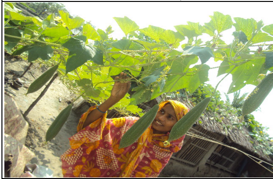
DcKri tffWmt` i eKí R̄meKiq̄b (m̄iã Pvl)