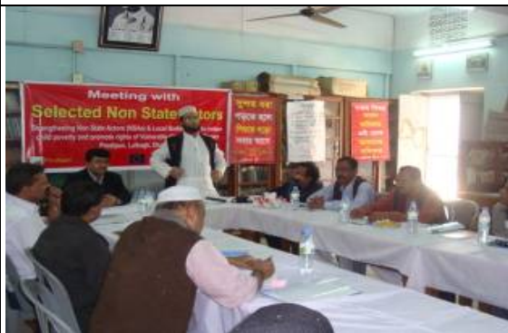
Meeting with Selected NSAs