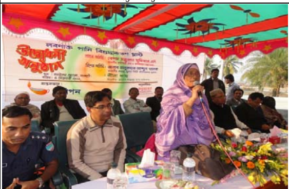
ii fim o Amigwmm tgu k tbi Di o vabx Abp o b