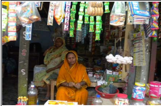
Այգ քոցյ K Kիիբց (IGA)