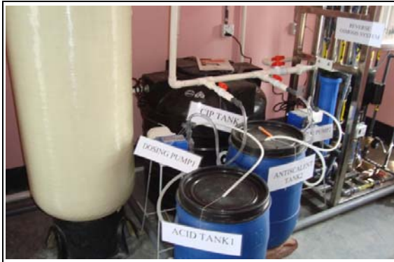
ii fim o Amigwmm tgu k b