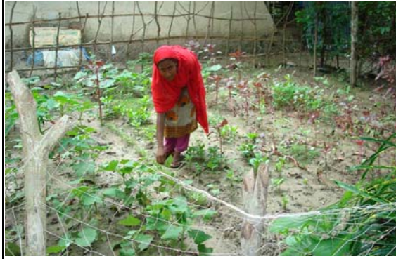
weKí Kgms'vb (míá Pvl)