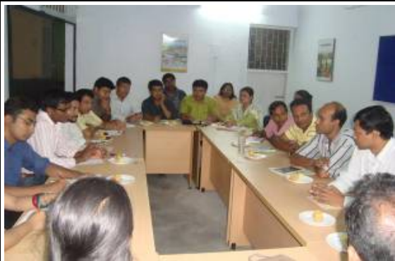
Meeting with NGO networks