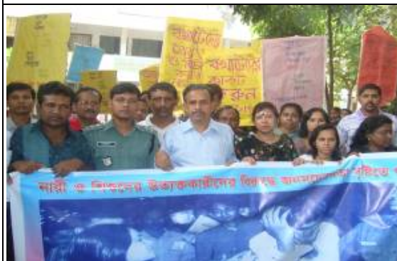
Rally against Eve teasing