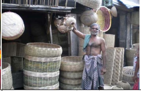
weKí Kgms'vb (ewtki KvR)