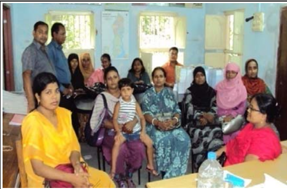
uk`K/uk`KvR` i I ni tqbUkb