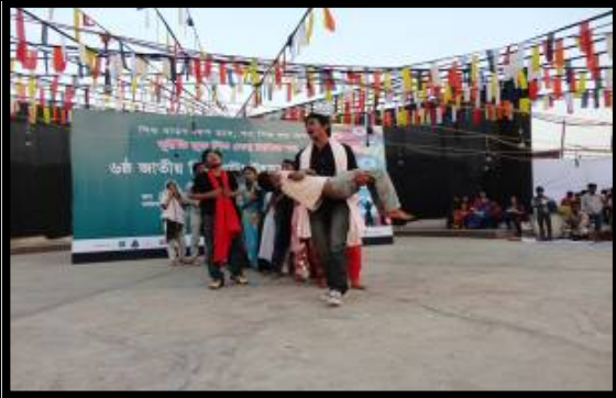
6th International Theater Festival