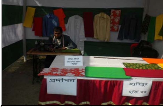
weKí Kgms'vb ('wRqKvR)