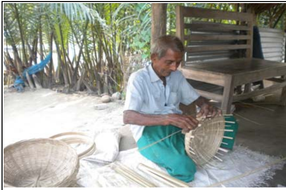
Այգ քոցյ K Kիիբց (IGA)