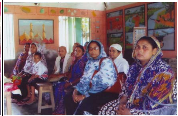
m#ccq Kvgj #dij v# i #0gwmK mfv