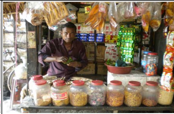
Այգ քոցյ K Kիիբց (IGA)