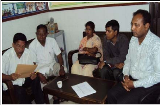
mnthwlr ms`v` i mvt_ mgSq mfv