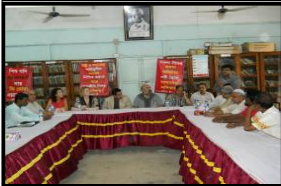
British All Party Parliament Members