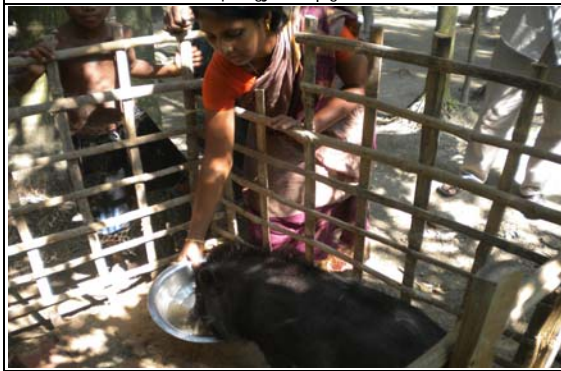
Այգ քոցյ K Kիիբց (IGA)