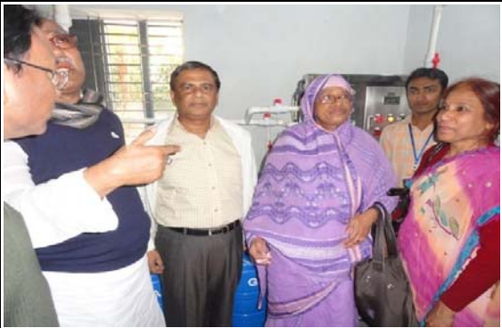
ii fim o Amigwmm tgu k tbi Di o vab