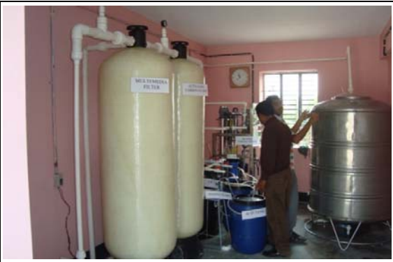
ii fim o Amigwmm tgu k b