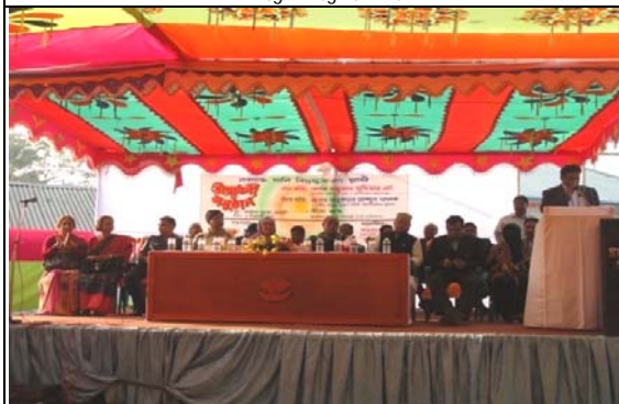
ii fim o Amigwmm tgu k tbi Di o vabx Abp o b