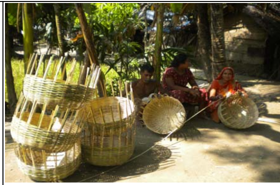
Այգ քոցյ K Kիիբց (IGA)