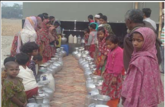
ii fim o Amigwmm c o l o l o q c o l o Z o i o e o i x L o evi c o mb mi o e o ivn