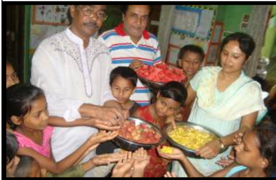
Fruits festival at LRC